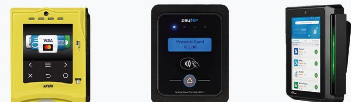
POS Payment Integrated