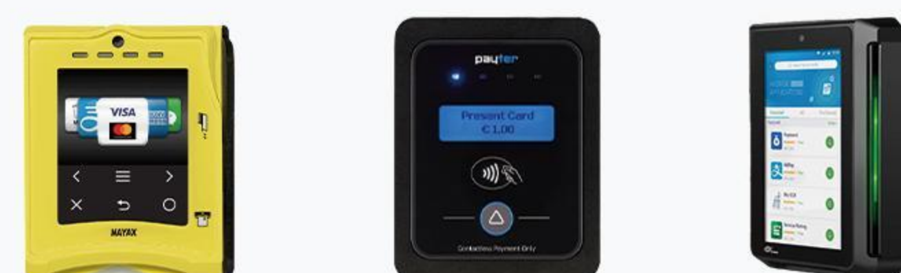
POS Payment Integrated